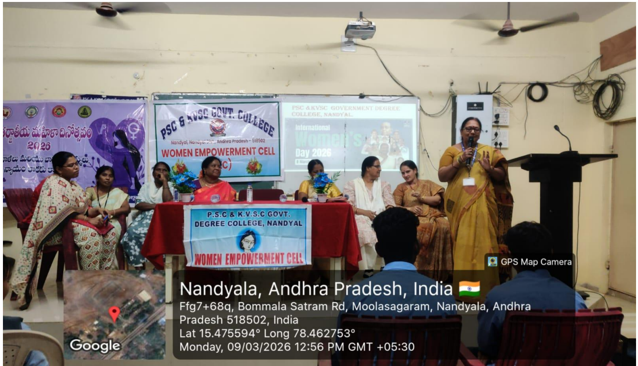
Nandyala, Andhra Pradesh, India 🇮🇳 Ffg7+68q, Bommala Satram Rd, Moolasagaram, Nandyala, Andhra Pradesh 518502, India Lat 15.475594° Long 78.462753° Monday, 09/03/2026 12:56 PM GMT +05:30